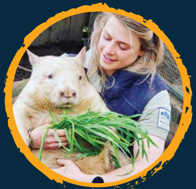
'Honey Bui' our rare golden wombat