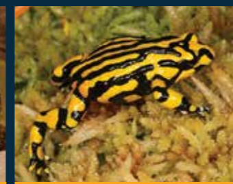
Southern Corroboree Frog