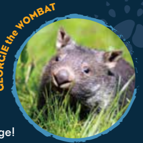
GEORGIE the WOMBAT

Patrick met many Hollywood stars and was named by CNN Travel as "Third best mascot in the world"!