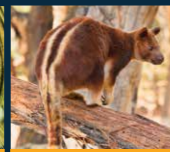
Goodfellow's Tree Kangaroo